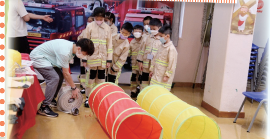
Roll up the fire hoses properly for next time.