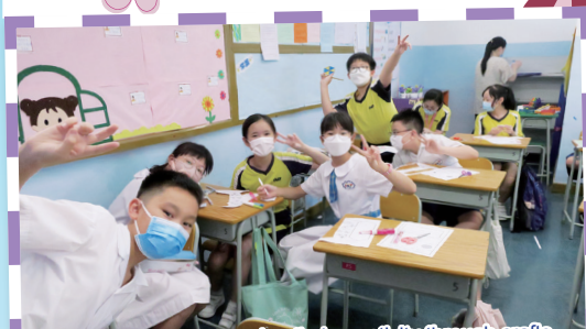
P5 students are expressing their creativity through crafts.