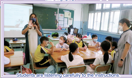
Students are listening carefully to the instructions.