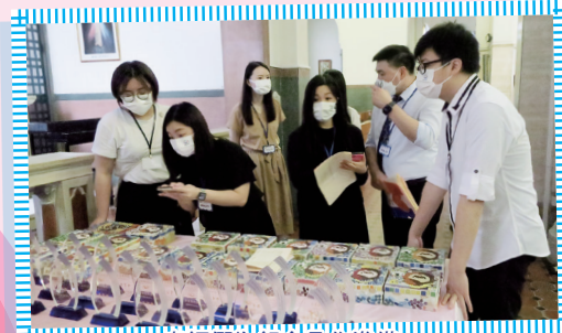
老師們為紀念品作準備。