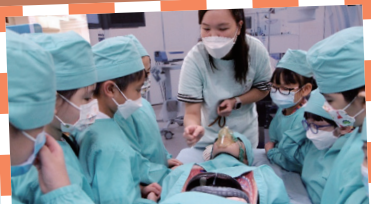
These are the organs inside our bodies. Try to recognise them!

On May 25 th , our school hall was filled with enthusiastic P.2 students, all laughing as they role-played as firefighters, flight attendants, paramedics and nurses. The activity "Dream Come True" was organized by our English Department aiming to enrich our students with new learning experiences outside the classroom. 'Dream Come True' is valued as a tailor-made package for students aged 7-9. Our school believes that learning English is no longer just a matter of learning grammar, but rather, it should be complemented by daily life experiences through hands-on activities. When it comes to learning English, we encourage students to use their imagination and creativity and be active in their learning. Undoubtedly, our students had enjoyed themselves role-playing as nurses, flight attendants, paramedics, and firefighters. Their enthusiasm showed that the props, costumes and backdrops had successfully created a student-friendly environment for language learning. With the instructors' guidance, students were able to learn more vocabulary and information about these professions. Throughout the morning, they rotated between the professions and finished the missions that had been designed for them at each station. At the end, there was a summary and review delivered to all. We are looking forward to having fun learning English in the next workshop!