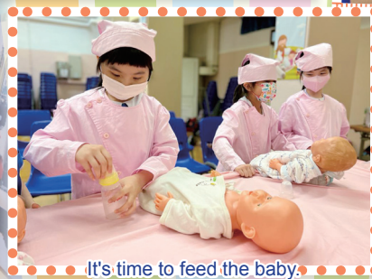
It's time to feed the baby.