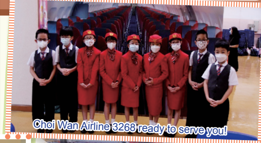
Choi Wan Airline 3268 ready to serve you!