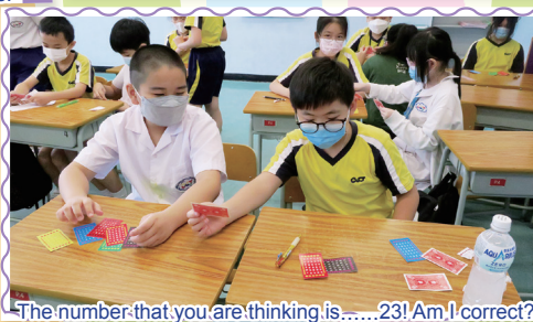
The number that you are thinking is.....23! Am I correct?