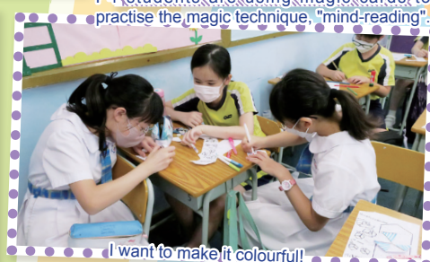
I want to make it colourful!