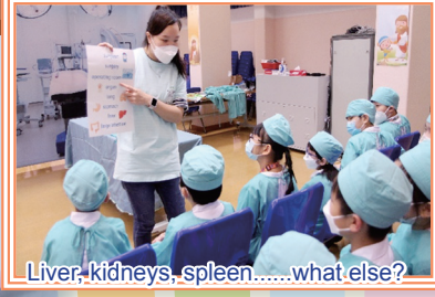
Liver, kidneys, spleen.....what else?