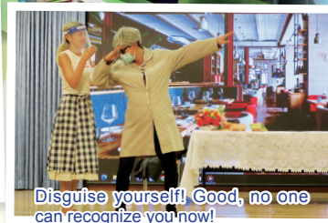
Disguise yourself! Good, no one can recognize you now!