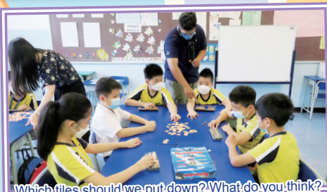
Which tiles should we put down? What do you think?