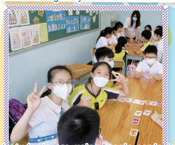
P4 students are using magic cards to practise the magic technique "mind-reading".