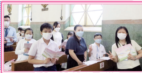
何老師與家長和同學一同拍照。