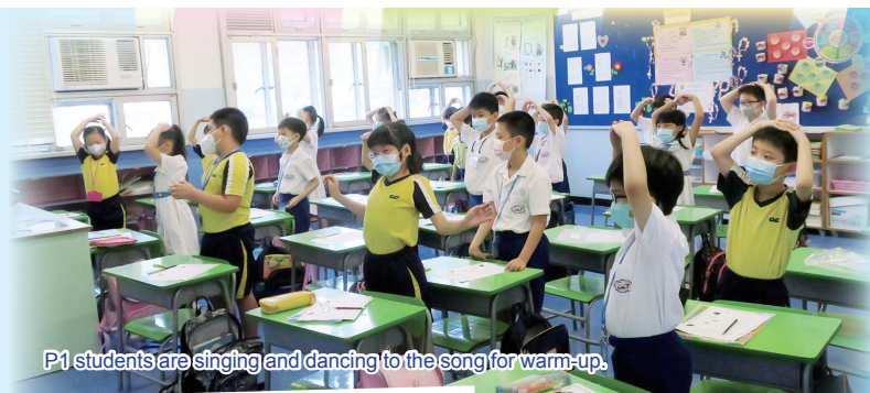
P1 students are singing and dancing to the song for warm-up.

Laughters can also be heard all over the school as students were engaging in a variety of interactive and hands-on English activities, like singing and dancing, performing magic tricks, making crafts and doing scientific magic experiments!